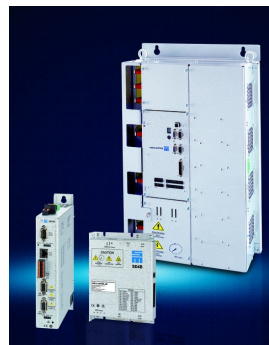
Figure 1: The SD4S servo amplifier family comes in different sizes and features CANopen connectivity